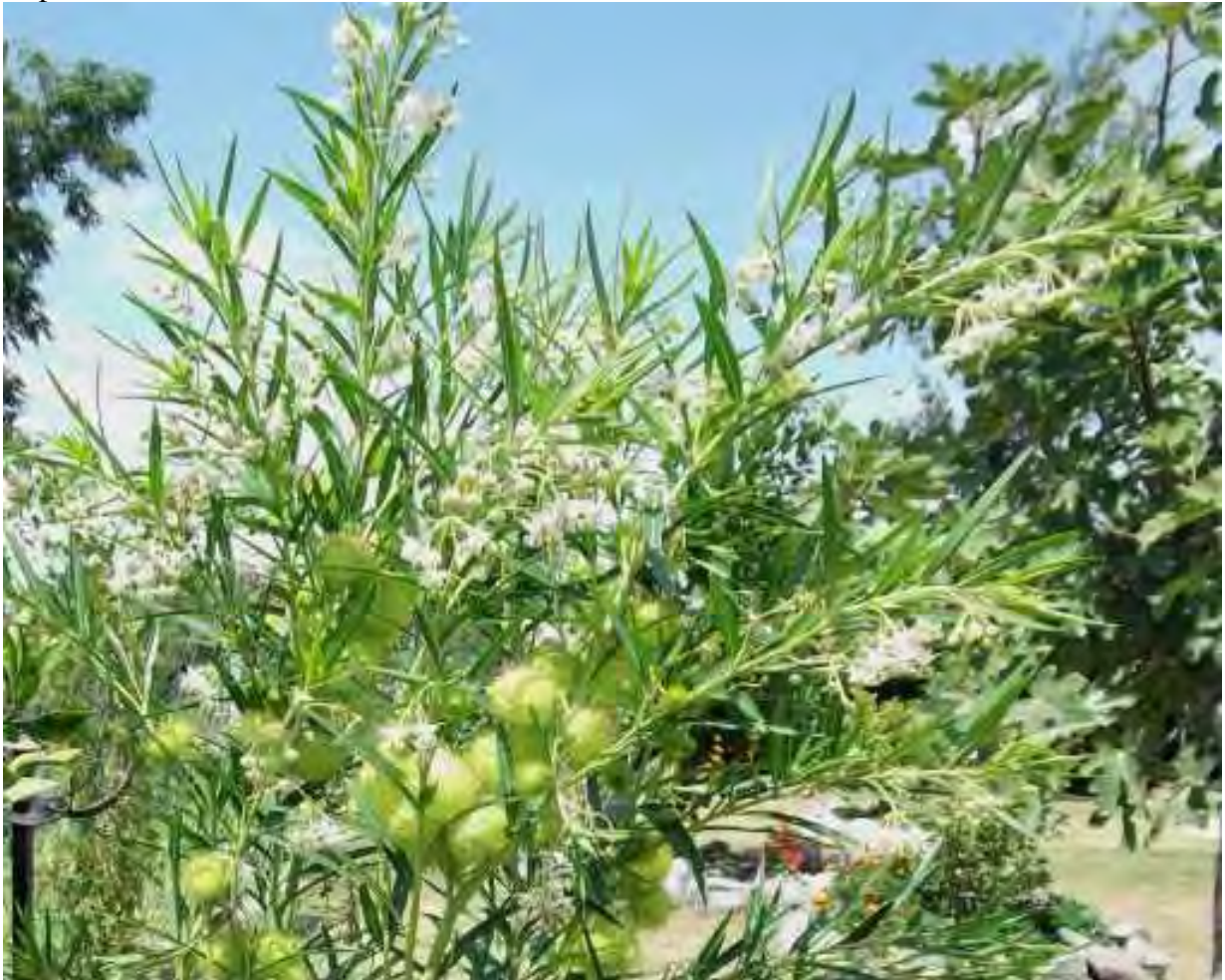
Fig:14. The Swan Plant, showing plant, flowers and seed-pods.

One thing for sure, it is so unusual that you will get all your neighbours and friends asking you what this plant is called, and asking you for seeds, as it is a real eye-catcher! Maybe you can encourage these folk to garden in a butterfly friendly way at the same time? Every little helps!