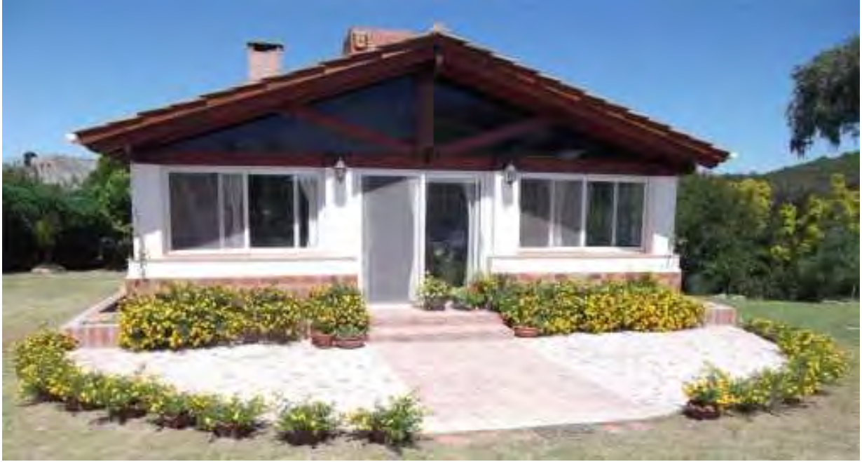
Fig.1. This is the butterfly friendly entrance to our house. Both me, and the butterflies love it! The beds are full of Yellow Lantana, which flowers continuously all season. Lantana is one of the best nectar plants you can grow.