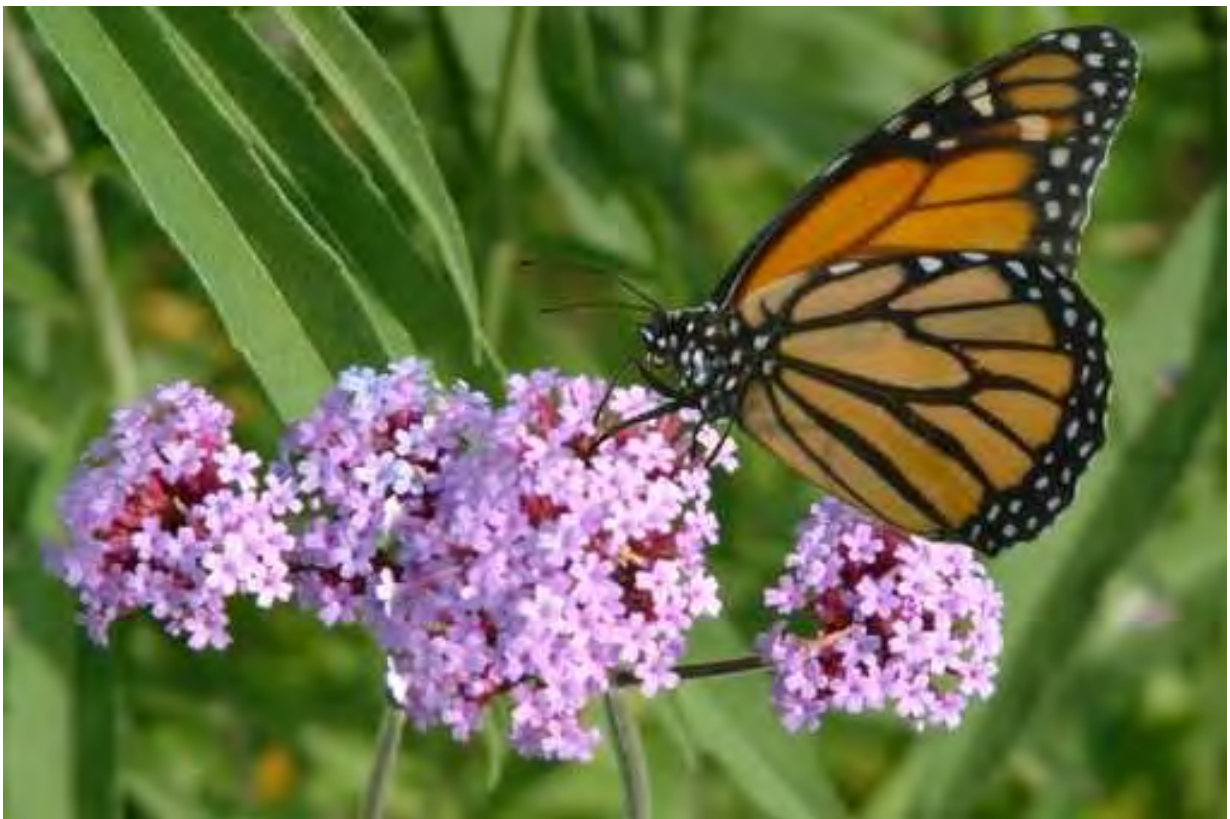
Fig:6. Monarch nectaring on Verbena

So here's one final point before we move on. Many folk think that caterpillars are complete pests and will eat to the ground any plant you put in your garden. In fact butterflies are extremely selective and choosy on which plant their caterpillars will feed on. If you put a young caterpillar on an unsuitable hostplant, it will starve to death without even taking a nibble from the leaf!