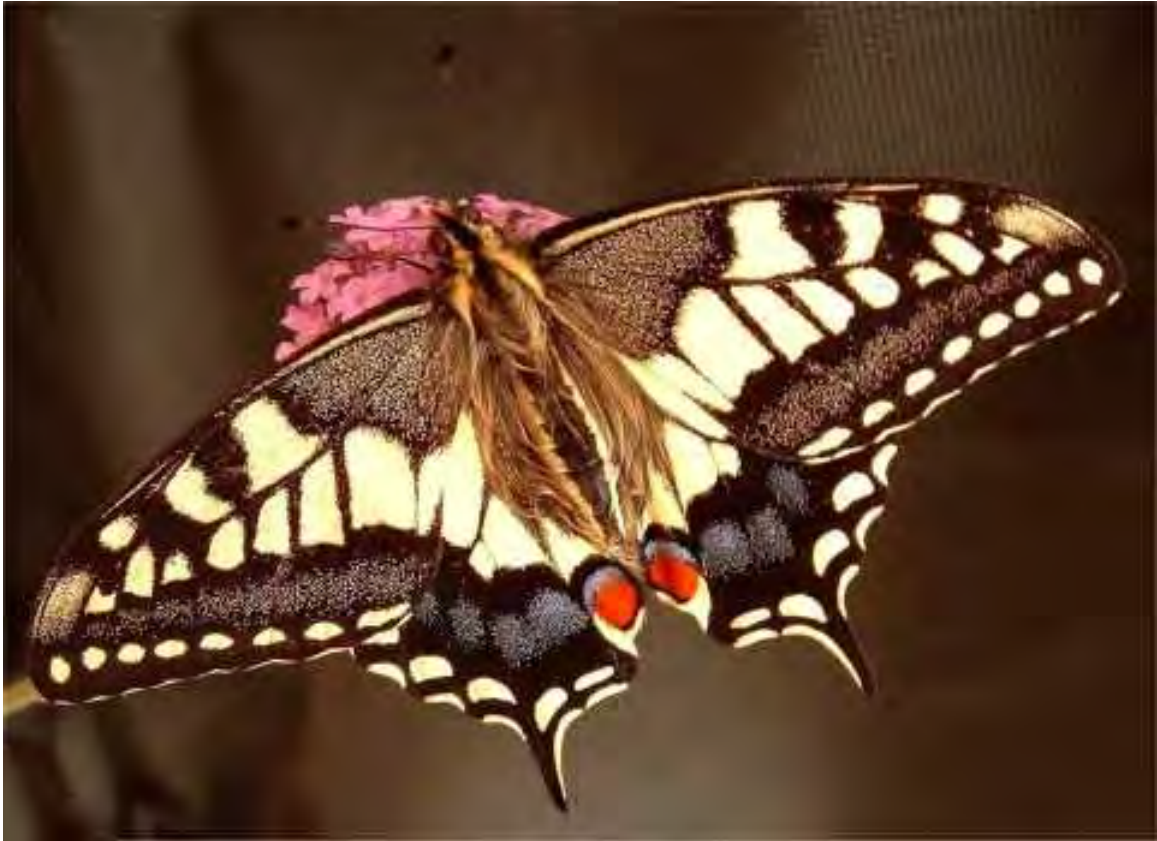
Fig:22. Old World Swallowtail, ( Papilio machaon ). This butterfly has a huge range around the Northern Hemisphere and is locally common in Europe.