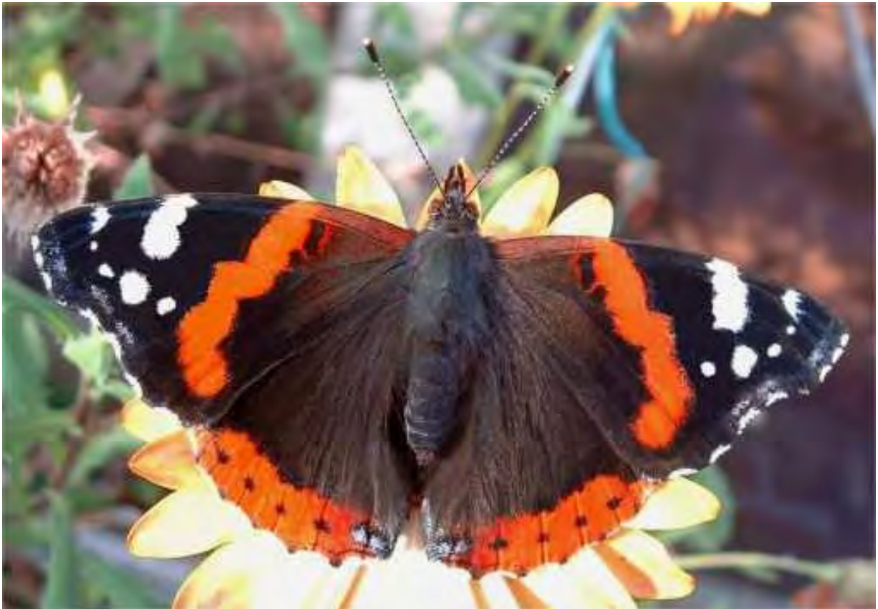
Fig:4. Red Admiral, a garden favourite. The caterpillars feed on Stinging Nettles.

So at this point, I hope I hope we have stimulated your interest in doing something to reverse this, and at the same time enable you to have an even more enjoyable time when sitting in your garden!