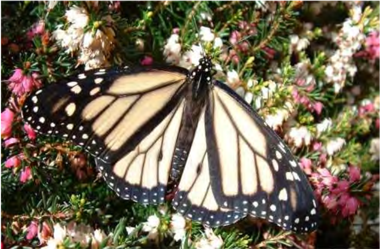
Fig:11. The beautiful white Monarch, a rare variation from the normal orange.

To continue growing this plant in the colder regions the following spring, just collect the seed-pods as they ripen. Wait until the pods are a greenish-yellow, and put them somewhere to dry out. To collect seeds from all the silky fluff, an old friend of mine from the UK, Bernie Farrell, had a great solution, which works perfectly. His recipe is, wait until the pods have dried enough and just started to split along the edges, then put them all in a plastic bag and knot the top. Pour yourself a glass of wine, sit in a comfortable spot in the garden and bash the plastic bag about, (Presumably stopping occasionally to sip your wine!) After a short time, you just take the plastic bag and cut a small hole in one corner, and you'll find all the seeds have collected there, now just pour out the seeds into a container. This method leaves all the silk and dead pods inside the bag that can just be put in the trash-can, and dry seeds ready to be stored for next season. Of course now you have seeds, you just start off again as already described. An easy way to store the seeds for the following season is to just pour them into an envelope, seal it shut, and you are ready to you start the whole process again.