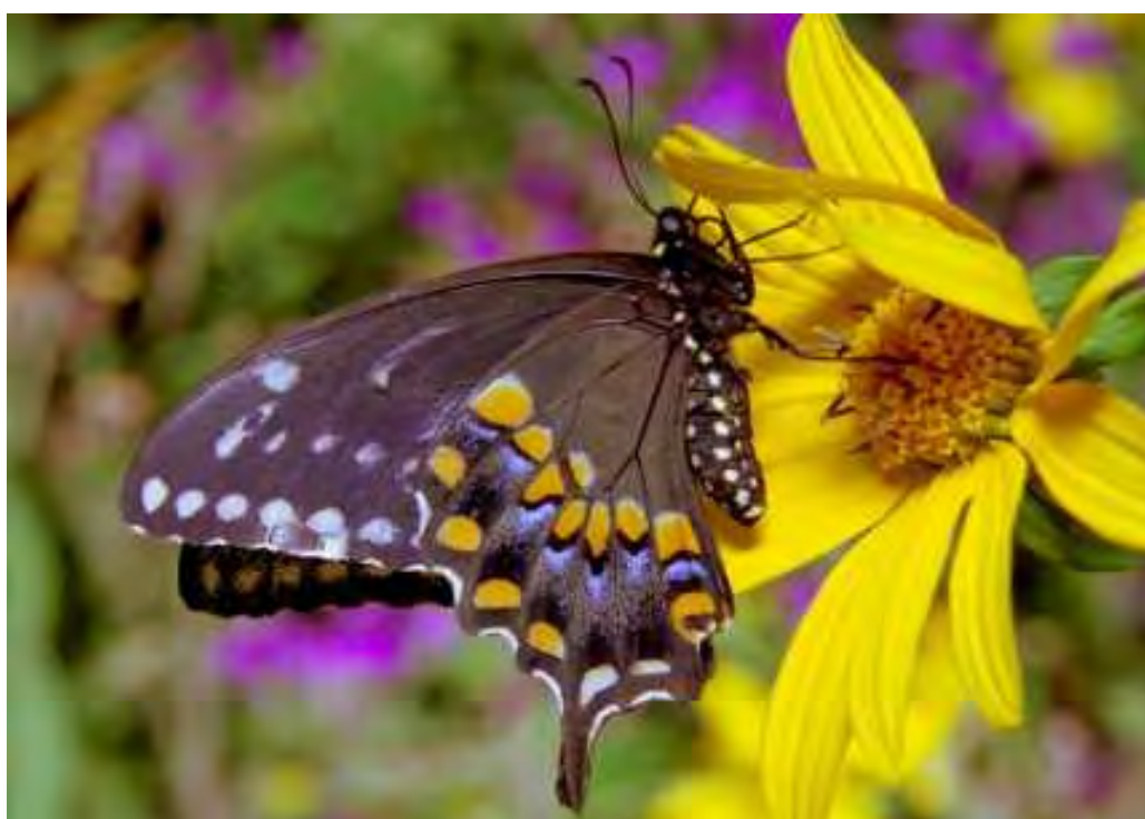
Fig:20. Black Swallowtail, ( Papilio machaon ).

Below is a beautiful picture of one of the most widely distributed Swallowtails in the US that occurs from North to the far South of the U.S. that you are certain to see in your garden.