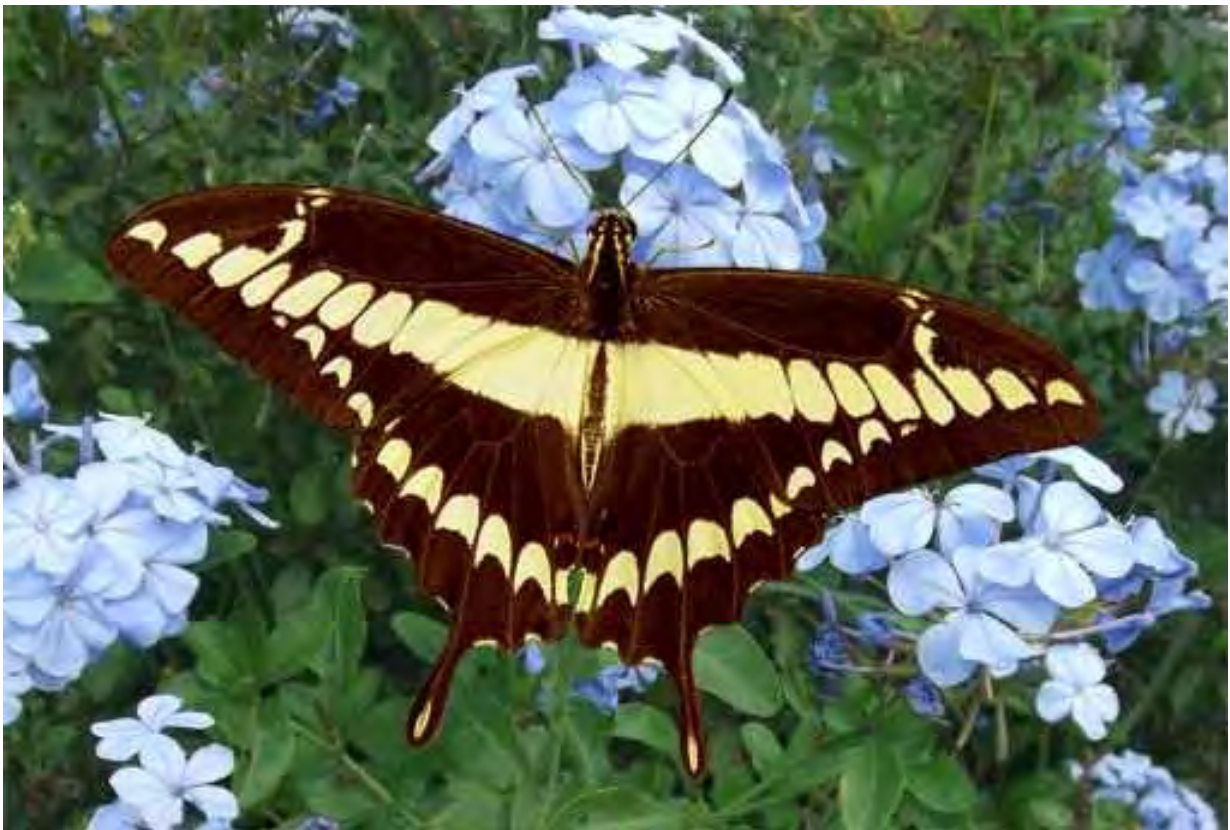
Fig:21. The Giant Swallowtail.

One word of warning when handling Rue. This plant can sensitise your skin to sunlight, and although it can have a varying effect, you can find you develop a red to purple blotches on your skin and this can take a long time to go!