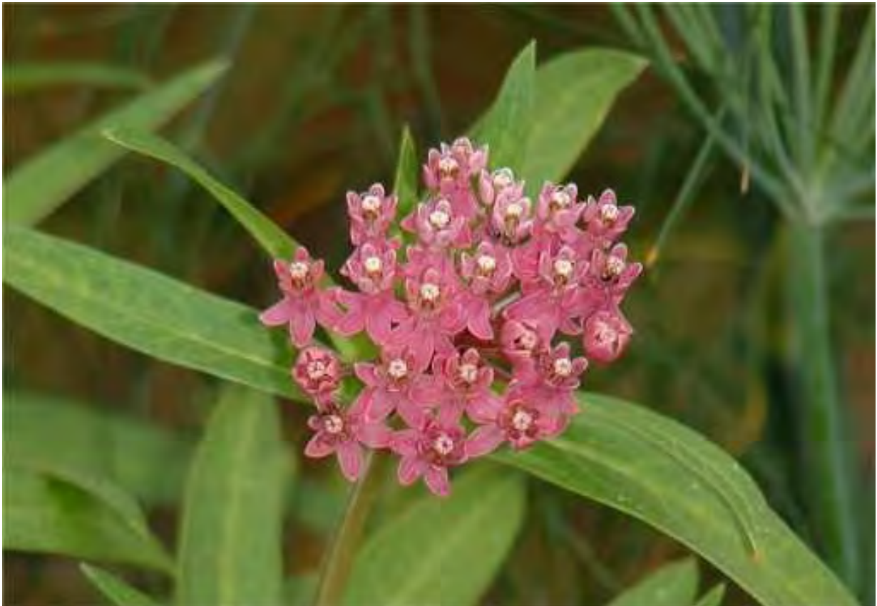
Fig:12. Swamp Milkweed or Rose Milkweed. ( Asclepias incarnata )

This is a North American native plant and in its wild form, Swamp Milkweed has lovely pink flowers, and never grows more than 3ft tall. A perennial and you don't even need a swamp to grow it! Although it has thick fleshy roots adapted to grow in wet places and heavy damp soils, in my experience it does very well in even moderately dry soils. One big difference between this and Tropical Milkweed is that this plant is fully hardy, and will come up year after year. There are even some cultivars available from your seed supplier, and you can choose between pink, pink with deep red spots, and white flowers. Again you should have no problems finding a supplier.