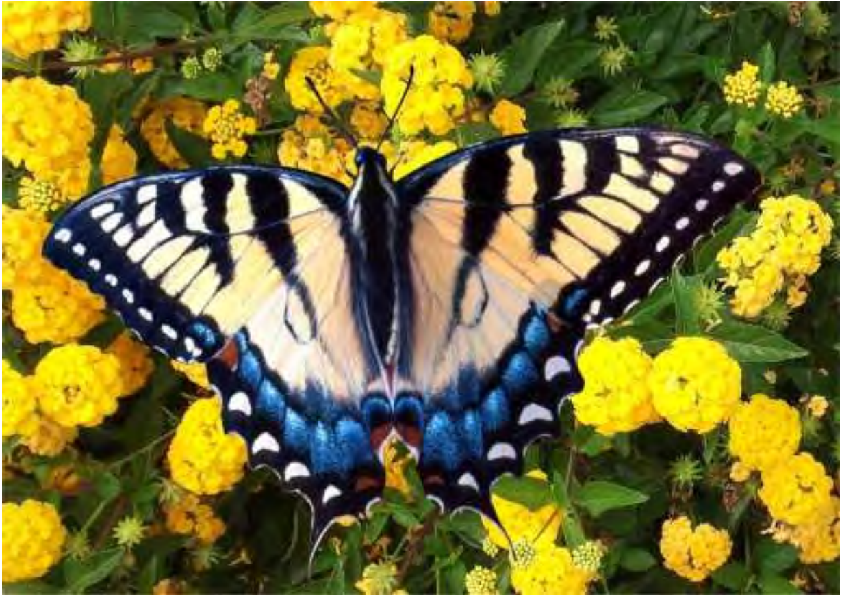
Fig:23. Tiger Swallowtail,

The Tiger Swallowtail caterpillars feed on many different trees and shrubs, the favourites are Willow, Cottonwoods, Birches, Cherries, Ash and Tulip Poplar. Don't worry that the caterpillars will be stripping your prize garden trees, as Swallowtails lay their eggs individually. The females may lay a few eggs then fly on, and the caterpillars are often unnoticed by us in our gardens.