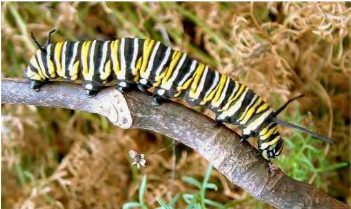
Fig:17. Full grown Monarch caterpillar looking for a place to turn into a pupa.

It is of course much better if you can avoid spraying insecticides in your garden to avoid harming the butterfly caterpillars, and all books will tell you this. However, we do have to live in the real World, and there may be times when you need to take some action against pests on some of your existing plants. If you do have to spray, choose a windless day, or if you are lucky, with a gentle breeze blowing away from the Milkweeds and other hostplants you have planted. Try and get a fit-for-purpose insecticide, for example there are now some insecticides that will kill Aphids and do little harm to Ladybugs and butterfly caterpillars etc. Also look for a contact spray rather than a combined contact and systemic insecticide. A contact spray usually becomes ineffective after a day or so, while a systemic spray is absorbed by the plant and can remain effective for several weeks. And above all try to control the spray to the affected part of the plant only by using a sprayer with a longish spray extension that keeps the spray off you too! It's a bit of a mental struggle to decide if you have to spray or not, but if you do, and it does kill the caterpillars, more butterflies should arrive fairly quickly, and lay more eggs, and its better to have some butterflies, than none at all.