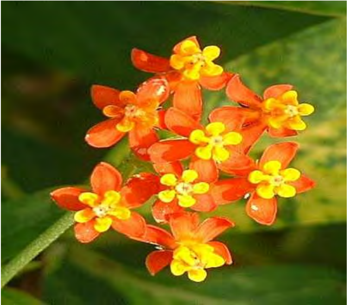
Fig:9. The beautiful nectar-filled flowers of Tropical Milkweed.