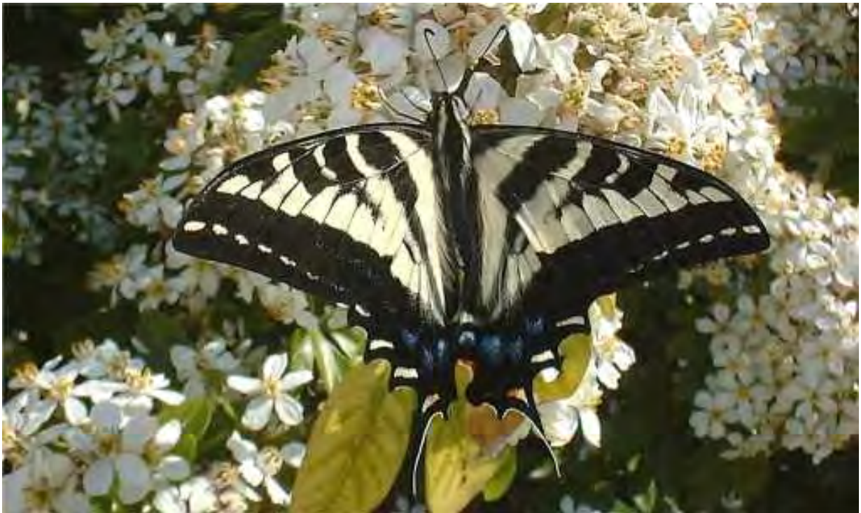
Fig:5. Pale Tiger Swallowtail nectaring on the non-native Mexican Mock Orange ( Choisia ternata )

For some reason we seem to be obsessed with non-native trees and flowers from other countries and regions. Of course many of these are in fact beautiful additions to our environment, but do we ever think if this is the same as our local wildlife sees it? We humans always think “the grass is greener somewhere else” and probably plant a lot more exotic plants than natives. The reality is of course, that many of these foreign imports are totally unsuitable for our local wildlife. So what we see as beautiful trees, shrubs and flowers, are in fact, in many cases are a desert for our local wildlife.