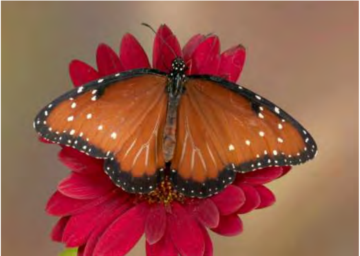
Fig 15: The Tropical Queen, similar to the Monarch, but you are unlikely to see it in your garden unless you live in the far south East of the U.S.

Due to its size you may like to consider planting this plant at the back of a flower bed, to allow other smaller plants to be seen at the middle of the bed and the front.