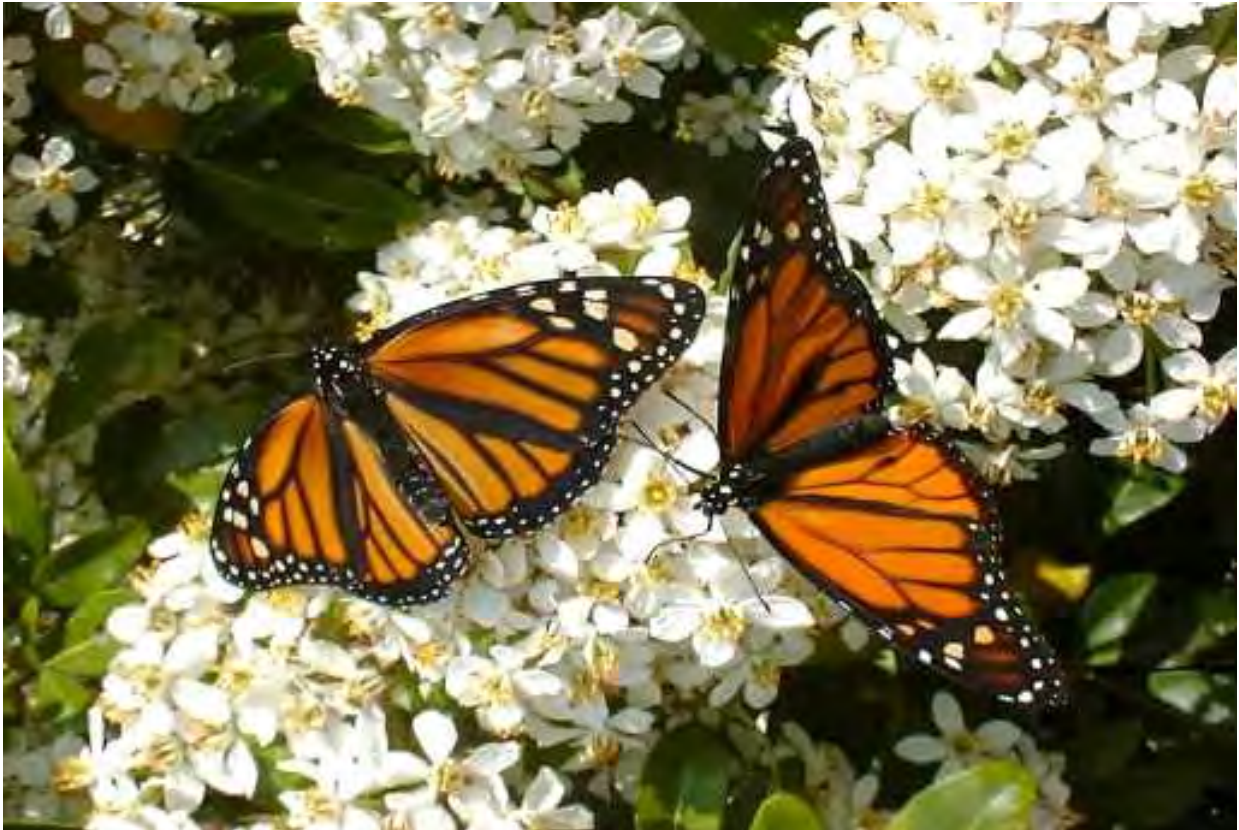
Fig:2. Monarch butterflies nectaring on the non-native Mexican Mock Orange (Choisia ternata)

So my aim is to keep things simple, and also help your local butterfly population in a World of continuous development that has little thought for wildlife. Another reason for keeping things simple is that there are already many conservation societies that have detailed and targeted programmes to help endangered species. This booklet is not about endangered species, only directly aimed at helping you to enjoy your garden to the full, and in your own small way, also help the butterflies. I have also included many beautiful photos to kindle your enthusiasm and to spur you into action to enjoy these beautiful butterflies for yourself!