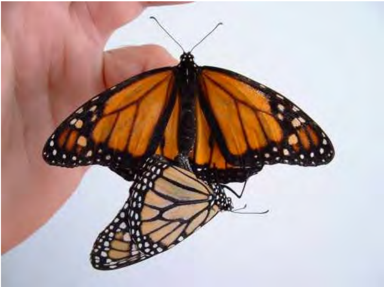
Fig:8. Monarchs pairing, the smaller female is hanging below the male.

Of course everyone knows the Monarch and its amazing life history, which starts and ends with a migration north and a return migration south. Many of you will have seen these butterflies in your garden during their journey. Their large size and bright Red/brown and black striped wings are a real eye catcher. There is also a similar, but more tropical species called the Queen, ( Danaus gilippus ) however, unless you live in the warmer south of the country, you are unlikely to see it! This does not matter as the caterpillars of both these butterflies feed on the same hostplant, Milkweed. If you have Milkweed growing in your garden, you are sure to attract Monarchs!