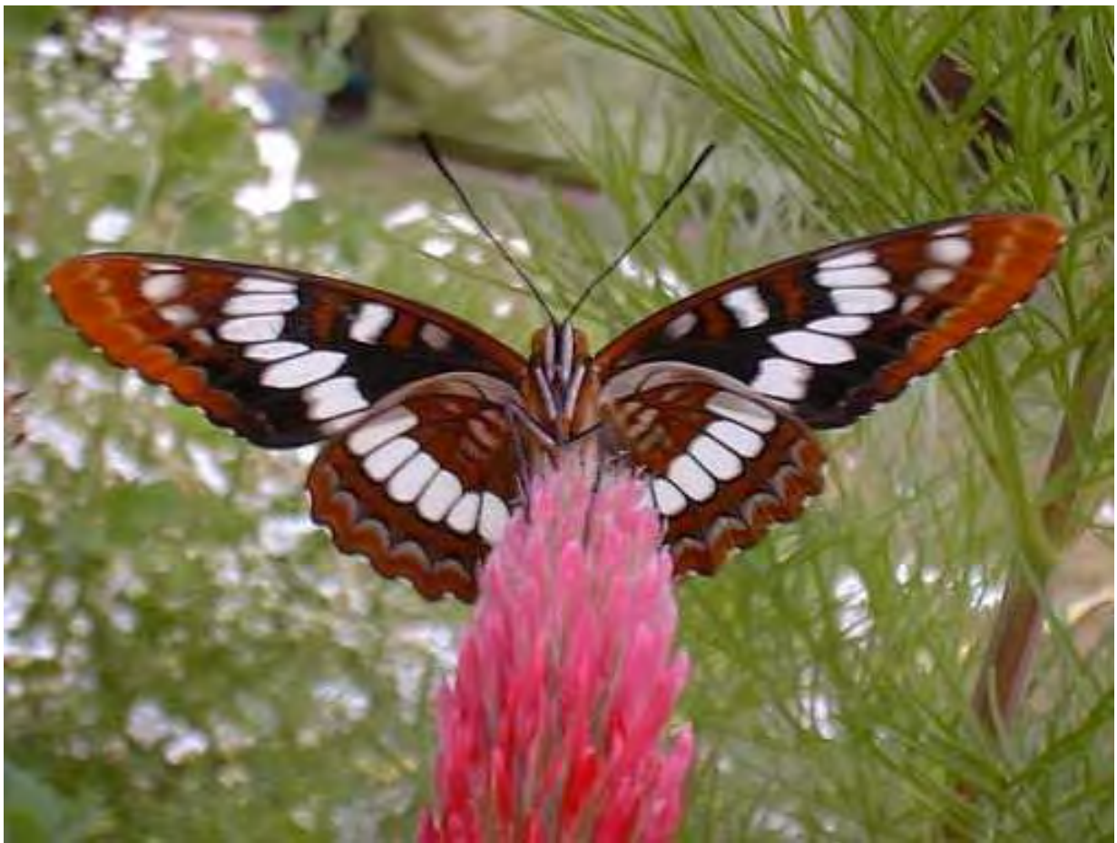
Fig:3. Lorquins Admiral nectaring on Clover.

Wouldn't it be a sad tragedy, and also so very selfish of us not to pass on the simple pleasures of life, like enjoying seeing butterflies, to our children, and then to their children and so on! As I said before, the problem lies with us! As a child I remember visiting one of the first wetland bird sanctuaries in the UK, and part of the tour included a picture with a closed curtain over it. In large letters above, it stated "Open the curtains and see the most dangerous animal in the World!" When the string was pulled to open the curtains, it was just a mirror, and you saw yourself! They were not wrong!