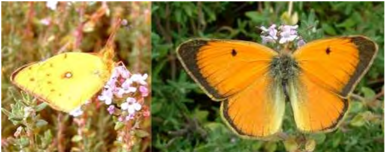
Fig:7. Sulphurs are a fine sight at flowers, the males are especially beautiful. The caterpillars only eat Clovers, so will not eat your other plants!

Don't be put off by seeing the hundreds of different species that are in the book! Remember your aim is only to try and get some pretty butterflies flying in your garden, and not try and save the population of every butterfly species in the country! But here's a thought, if enough people create a butterfly garden in many different places around the country, they, in turn, will be helping butterflies too, so it's a case of "Doing your bit!" You can make a difference, and many of us together can make a big difference!