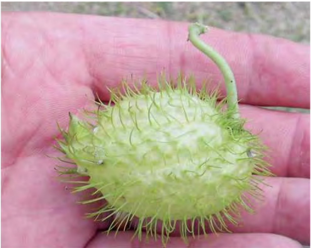
Fig:13. The interesting seedpod of the Swan Plant, is it a Swan or a duck?

So why is it called the Swan Plant? Here's a picture of the seedpod, which later turns a golden yellow color as it ripens. It resembles a swan, (or a duck?)