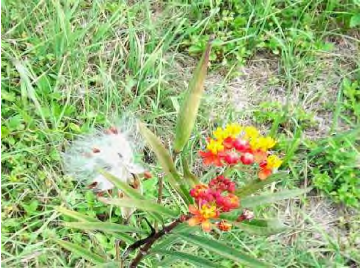
Fig:18. This picture shows a small Tropical Milkweed plant.

Above is a small Tropical Milkweed plant, showing flowers, seed pods, and split pods with seed. One more option! If you live in the warmer south of the US, you may find it a struggle to grow some of the northern native Milkweeds described, such as Swamp Milkweed, Common Milkweed and Butterfly Weed. You may like to try Purple Milkweed also called Heartleaf Milkweed ( Asclepias cordifolia ) This is one of the prettiest Violet/Purple flowering Milkweeds.