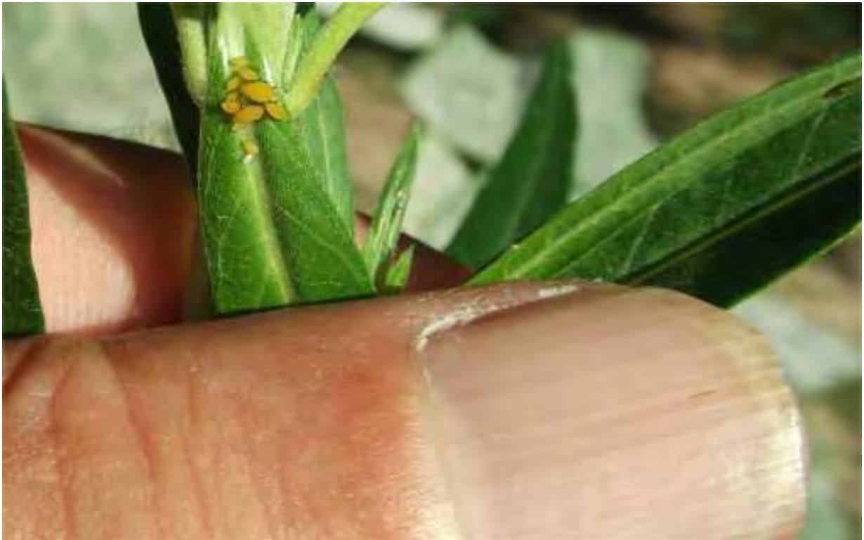
Fig:16. Milkweed Aphids. Best to just squish them with your fingers when you see them before they become too much of a problem!

There are not very many problems with pests when growing Milkweeds. The Milkweed beetle, and Milkweed Leaf Beetle can cause problems, best to hand pick them off when you