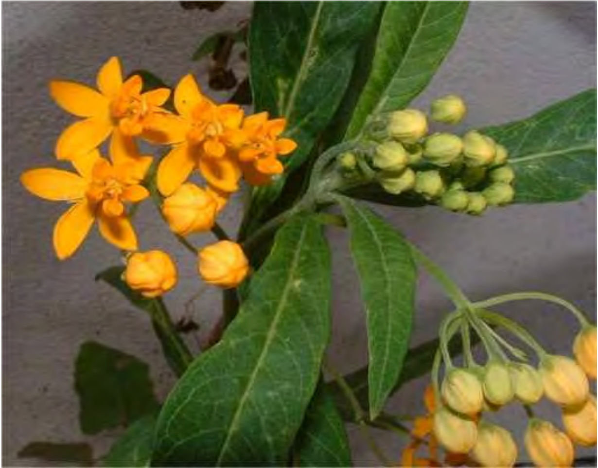
Fig:10. Tropical Milkweed also comes as a yellow variety, you may like to mix both varieties in your garden.

As these plants will grow to around 3ft (or sometimes a little more) think about where you will put them in your garden. Often towards the back of a flower bed is the best option and this allows other smaller flowers/plants to be seen at the front of the bed. (See some planting and layout diagrams at the end of this booklet to help you decide where to put them) As for planting the seedlings, you will now have a number of seedlings that may or may not have any compost attached to their roots. Not a problem, I generally found it best to just loosen the soil where I want to put them, (for example into an existing bed) and then either use a “Dibber” or an old broom handle to poke holes in the soil.